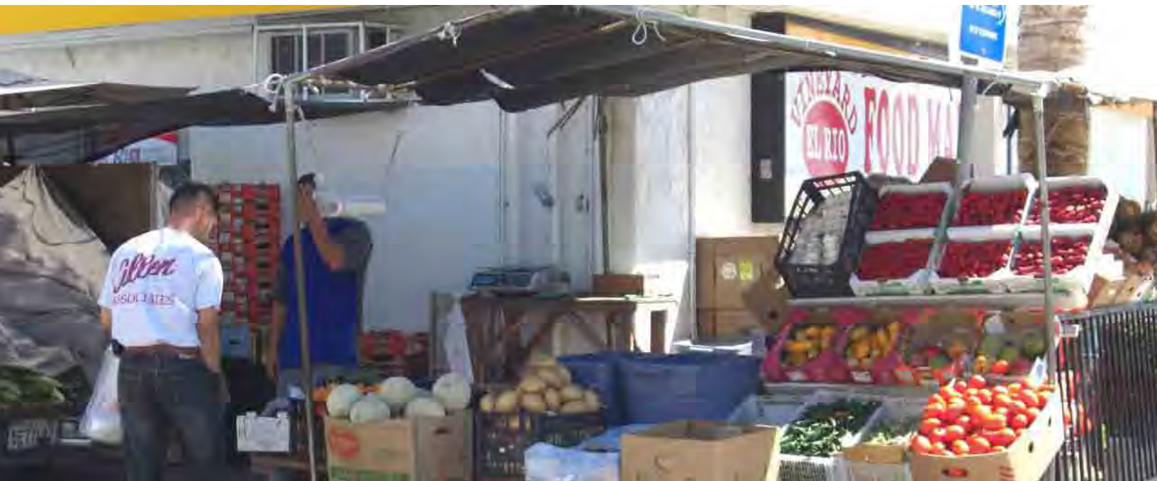
Photo: Numerous fruit and vegetable stands on Vineyard Avenue attract motorists and pedestrians.

Planned bus stops locations used in the analysis are listed in Appendix F.